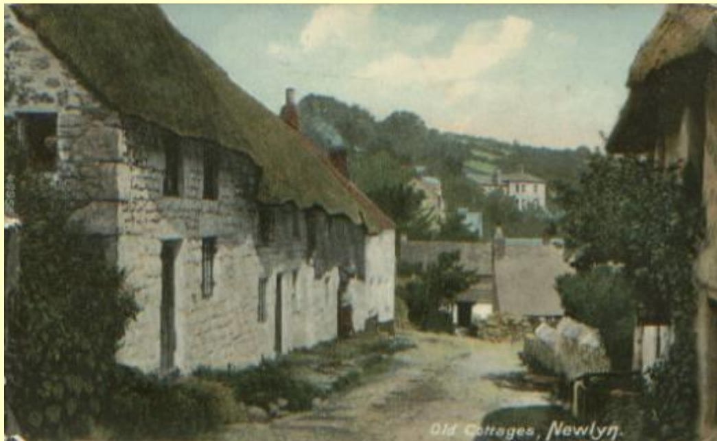
Old Cottages, Newlyn.