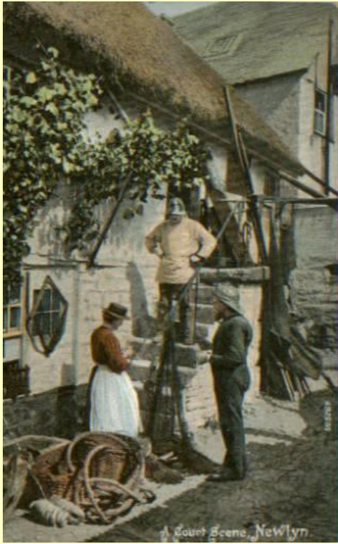
A Court Scene, Newlyn.