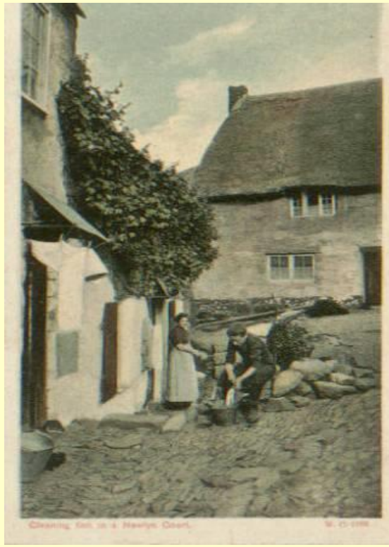
Cleaning Day in a Newlyn Court.